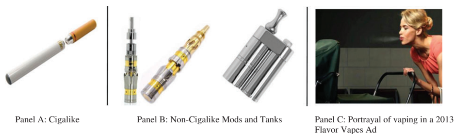
Figure 1 Cigalike/non-cigalike e-cigarettes and visual vaping cue.

and found that such pretend actions triggered more aversive psychophysiological responses than performing kinetically matched non-harmful actions (e.g., using a spray bottle). This finding suggests that moral aversion can be intuitively triggered despite people being aware of the absence of harmful consequences. In the context of e-cigarette commercials, even when people's harm perceptions about e-cigarette vaping were to be reduced by pro-vaping arguments, their moral opinions could still be susceptible to the influences of visual vaping cues. Because the resembled action of smoking is morally disapproved (Katz, 1997; Rozin & Singh, 1999), and because vaping resembles smoking so closely, visual portrayals of vaping can automatically activate a sense of moral outrage. The consequence is that exposure to such cues (e.g., a young woman vaping directly into what appears to be a baby stroller, see Figure 1, Panel C) are likely to increase support for vape-free policies, not necessarily in a logically deductive way but as a set of automatic cues reminding the consumer of a morally unacceptable behavior.